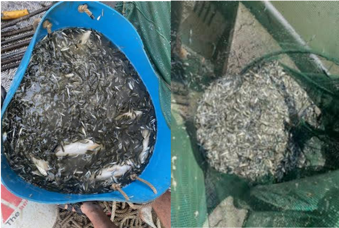
Figure 1. Catch from a single minnow fyke packed full with fish.