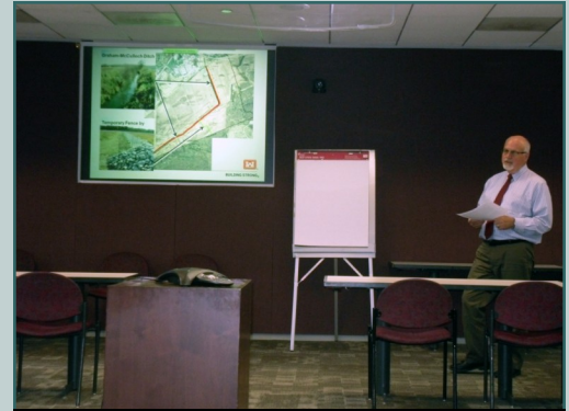
White House Council on Environmental Quality Asian Carp Director John Goss updates the GLMRIS Executive Steering Committee on Focus Area 2 efforts, Chicago, April 18, 2013. Representatives from the Council on Environmental Quality, state departments of natural resources, U.S. Fish and Wildlife Service, the Metropolitan Water Reclamation District, Department of Transportation, Great Lakes Commission, Corps of Engineers and U.S. Environmental Protection Agency were in attendance.

A study of the Graham-McCulloch watershed is also expected for completion this summer.